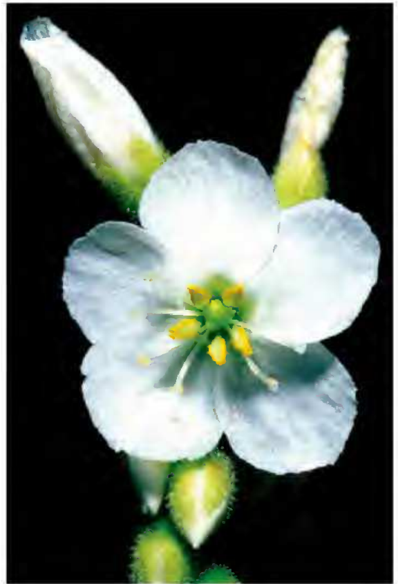
Figure 5: The white-flowering, mutant form of Drosera tracyi .

species when you consider the total ranges shown in Table 2—for example the number of flowers per inflorescence can range from 4 to 21 for D. filiformis and 12 to 20 for D. tracyi . The overlap here is significant, but the one-sigma ranges in Table 3 do differ much more clearly, i.e. , 7-15 for D. filiformis and 13-19 for D. tracyi .